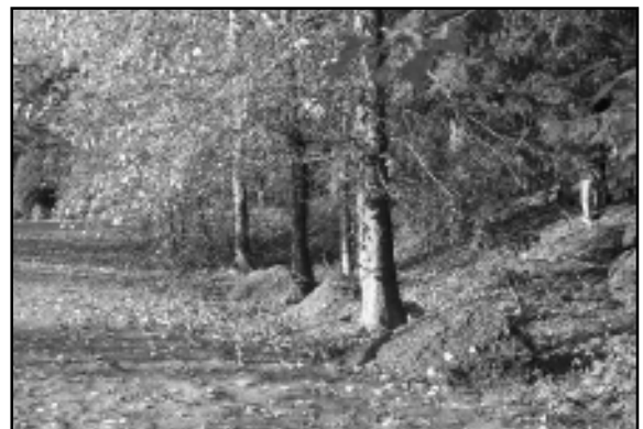
Native area with new plantings and mulch