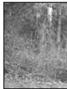
Blackberries choking out native plants

Condo neighbors volunteered for a total of ten Saturday mornings. In the spring, work parties removed the invasive plants, and individuals pulled shoots all summer. The last Saturday in October another work party planted 25 native shrubs in the reclaimed native areas and spread mulch around the plants to save water and prevent erosion. The mature shrubs will provide shade to deter blackberry growth. The “before and after” photos below show the fruits of their efforts.